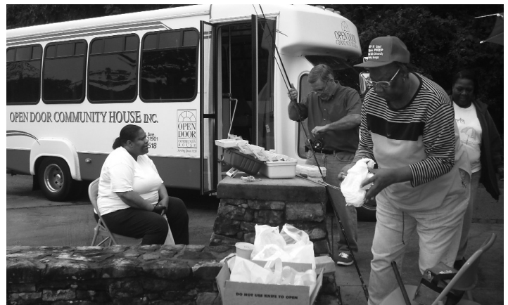
Seniors going fishing