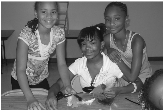
Teens in our Summer Academy program doing crafts.