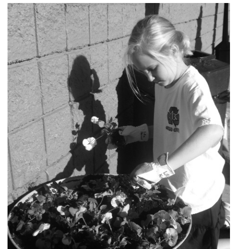
A Brookstone School 4th grader planting one last pansy in the flower pot.