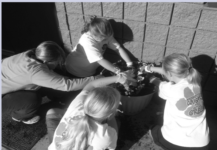
Brookstone School 4th graders planting pansies for all to enjoy!