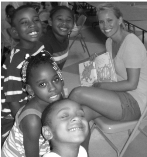
"JUMP" in action - A reading initiative to help bring students up to, or past, their class reading level.

Ear rings Bracelets Perfume Cologne Manicure sets Necklaces Ties Watches (Male and Female) Sports Equipment (Basketballs, Footballs, soccer balls) Outdoor games Purses Socks Ball caps Ear phones Inexpensive CD players Inexpensive MP3 players Inexpensive Digital Cameras CDs Radios FM/AM radio clocks DVD movies Art Sets Wii games Playstation 3 games Xbox 360 games Body lotion Beauty products Under clothes Bedding sets Jump drives (USB Flash Drives) Cosmetics Kits Nail sets Clothes